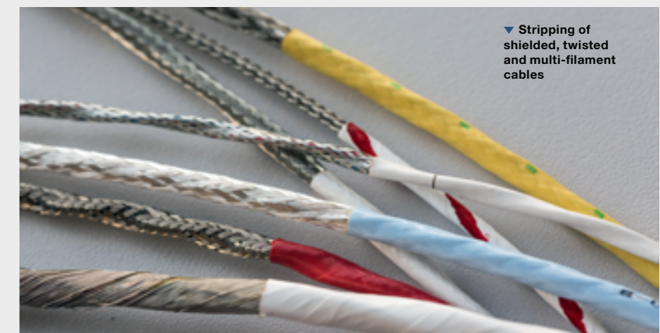
▼ Stripping of shielded, twisted and multi-filament cables